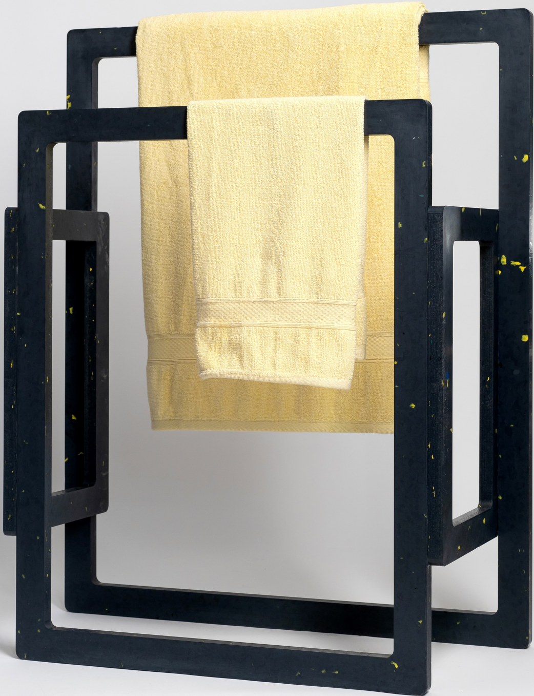
TOWEL RACK 80 CM X 65 CM X 26 CM