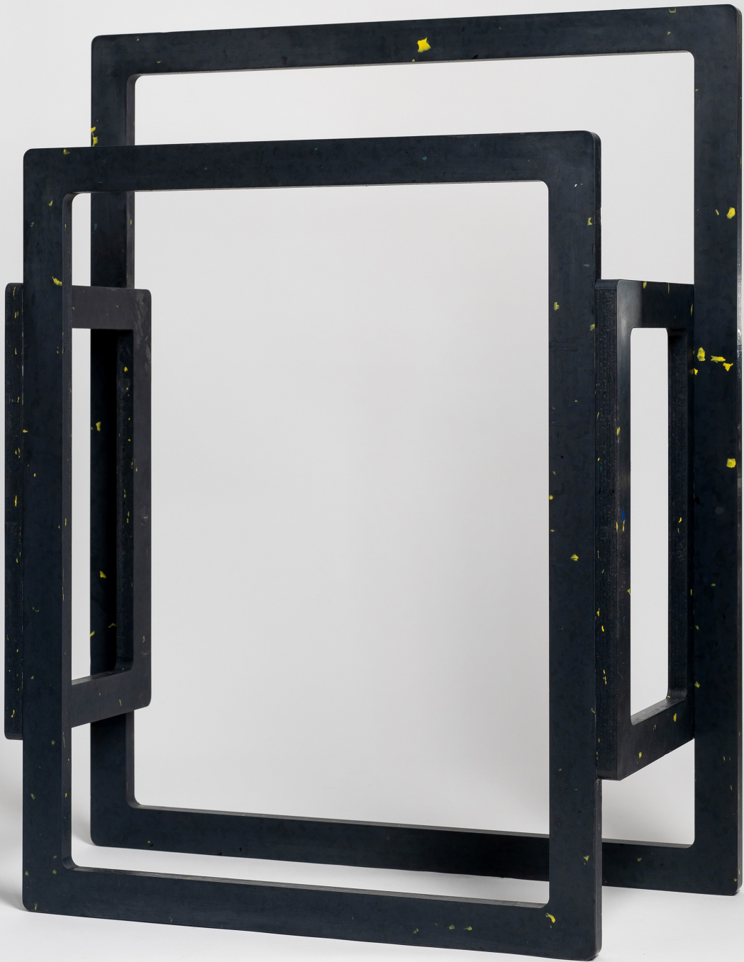
TOWEL RACK 80 CM X 65 CM X 26 CM